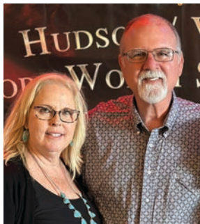
Hudson Longhorns Corydon, Indiana